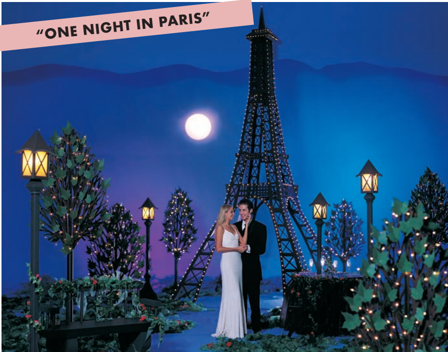
"ONE NIGHT IN PARIS"

A moody masquerade theme will lend a fun air of mystery to your Prom night. Decorate with the colors of black, gold, and red and hand out masks to all Prom attendees as they enter Prom.