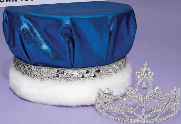
Majestic Monarchs King and Queen Crown Set