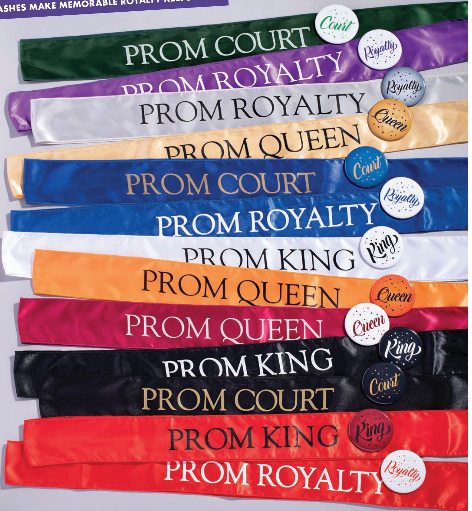
Prom Satin Sash and Button Sets

SASHES MAKE MEMORABLE ROYALTY KEEPSAKES!