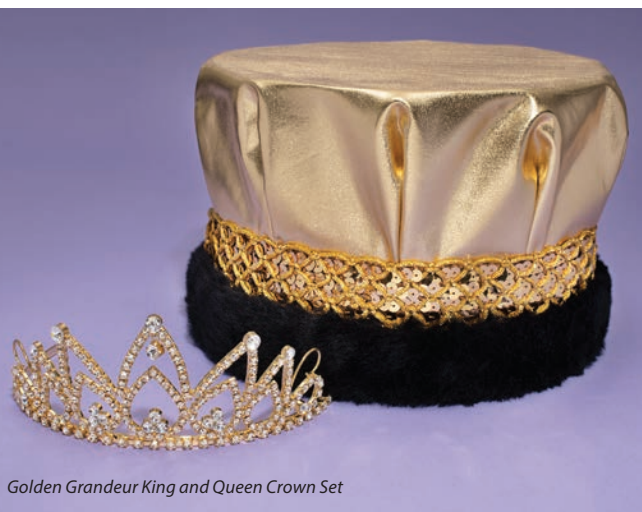
Golden Grandeur King and Queen Crown Set