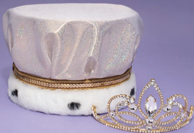
Iridescent Elegance King and Queen Crown Set