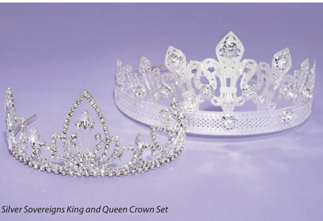
Silver Sovereigns King and Queen Crown Set